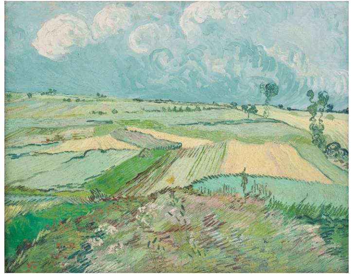
Vincent van Gogh, Wheat Fields after the Rain (The Plain of Auvers) , 1890, Acquired through the generosity of the Sarah Mellon Scaife Family, 68.18